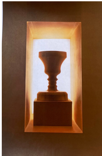
Left: Example of completed project. Right: Kenturah Davis' turned wood sculpture.