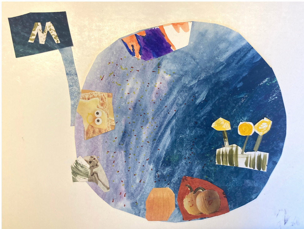
Collage by students at Toland Way

In this project, we will create an imaginary dream planet using watercolors and collage.