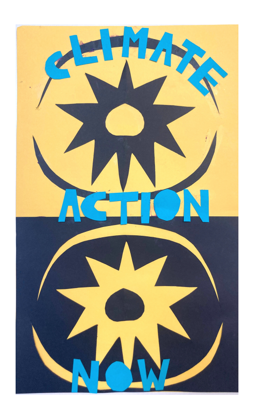
Example of protest poster using positive / negative space

In this project, the artist imagined a future where Black communities are not targeted by surveillance, facial recognition, and other technologies that target communities of color. She created these protest signs that were installed at 80 locations across New York City.